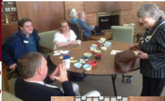
E B M O P W T L Y S