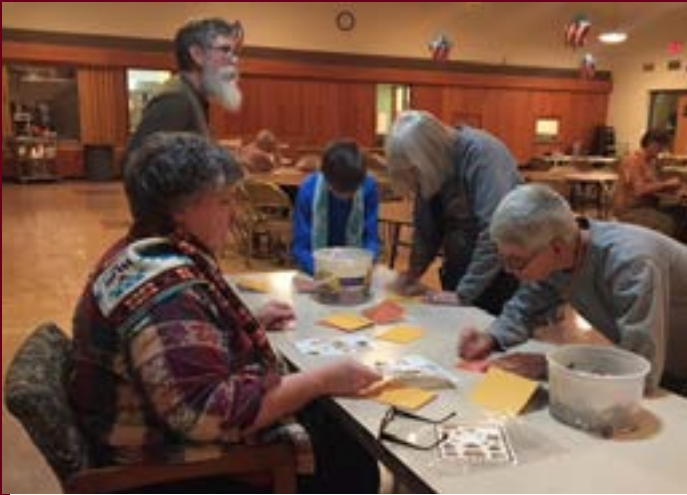
M E S S Y C H U R C H